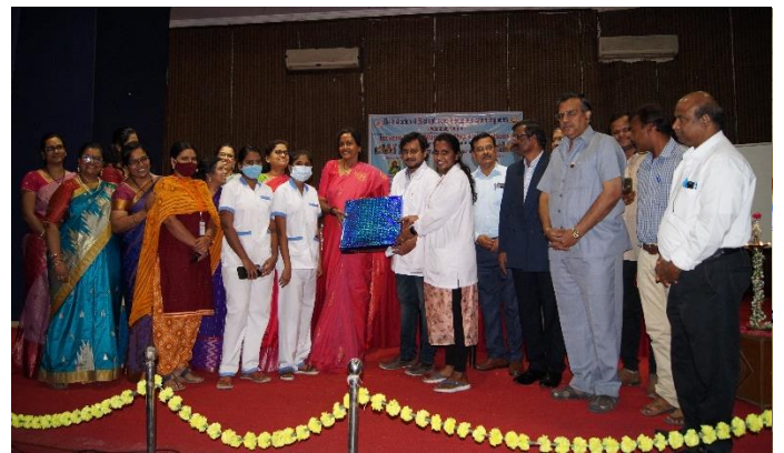
Free Health Camp by CMR Hospitals