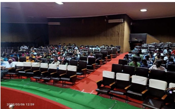
Interaction with Participants