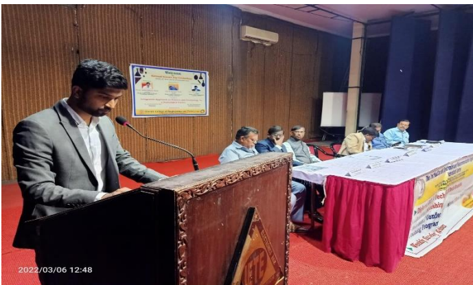
Address by Chief Guest