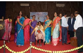
Felicitation to Chief Guest, Guest of Honor, Keynote Speaker and Doctor, CMR Hospital