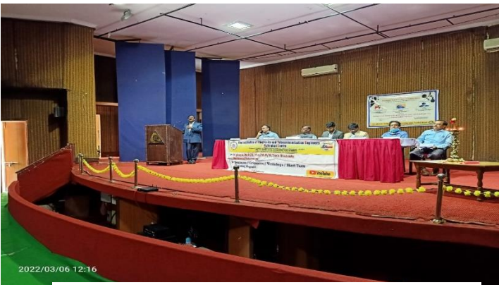
Address by Chairman