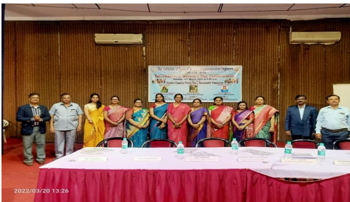
Chief Guest and Guest of Honor with EC