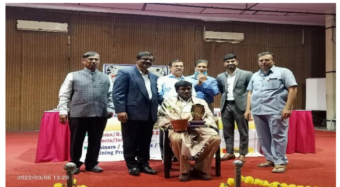
Felicitation to Keynote Speaker