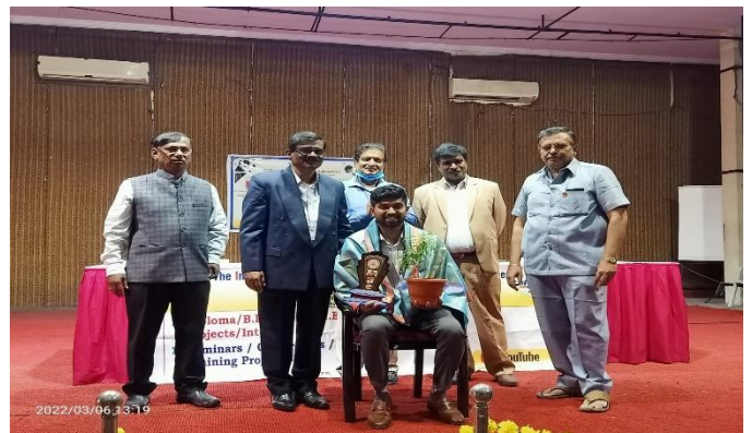
Felicitation to Chief Guest