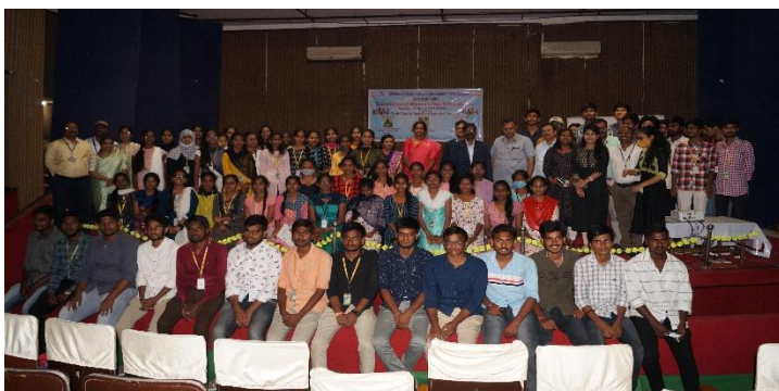
Group Photo of Chief Guest and Participants