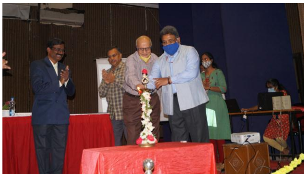
Inaugural Session of National Science Day