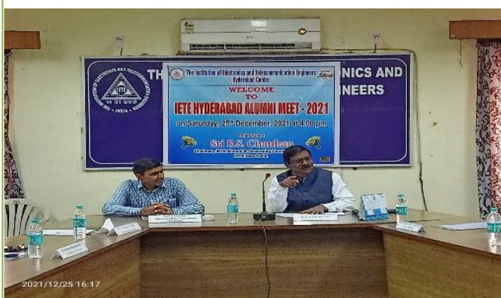
Address by Chairman