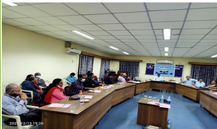
Discussion with Faculty Coordinators