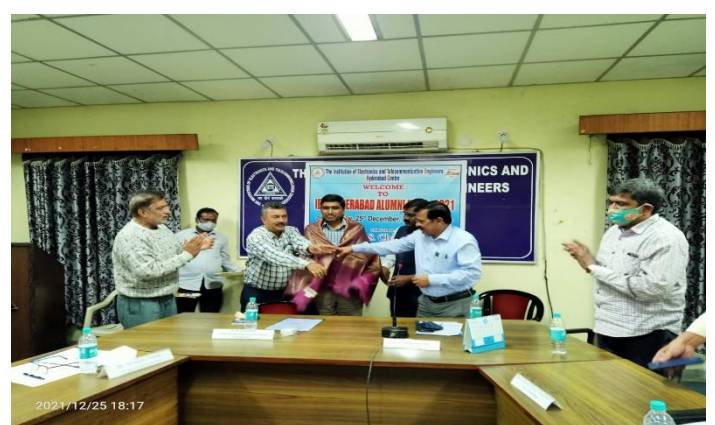
Felicitation to Chief Guest