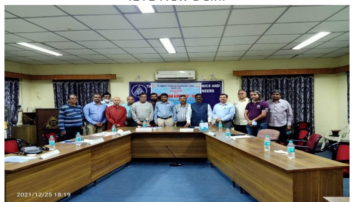
Group Photo with Chief Guest and Participants