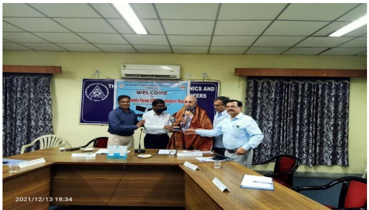
Felicitation to Chief Guest