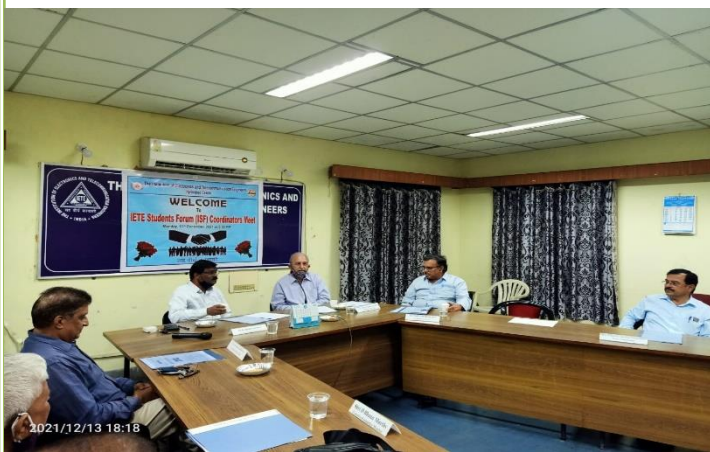
Address by Chairman