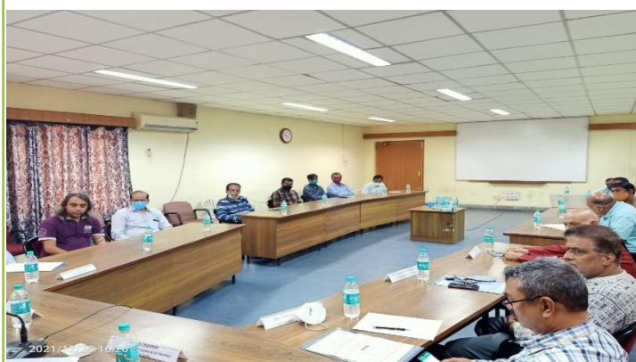
Interaction with Participants