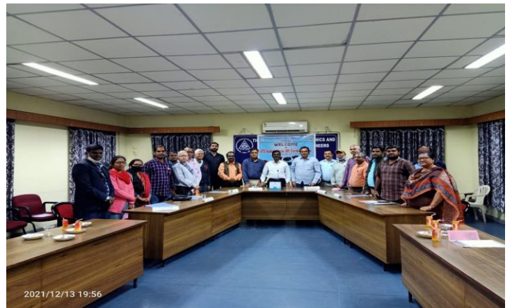
Group Photo with ISF Faculty Coordinators