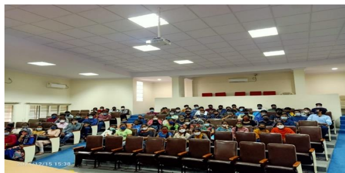
Students Attended for the Program