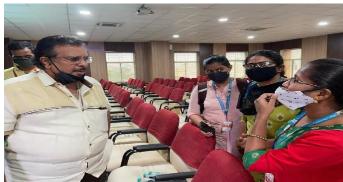
Photos of ISF Meeting