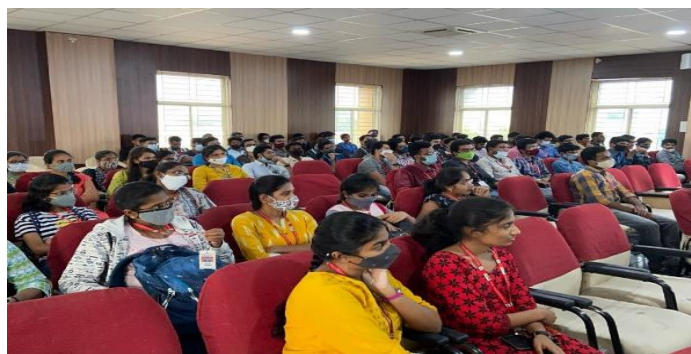
Students Attended for the Program