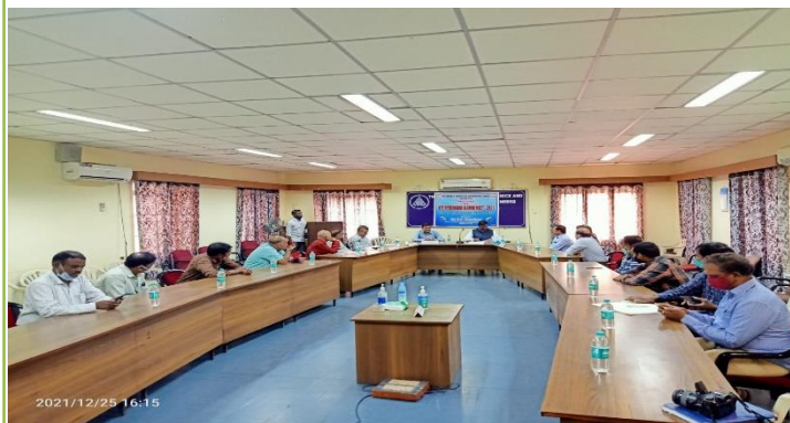
Interaction with Participants