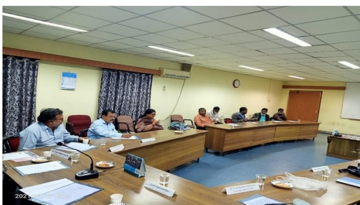
Discussion with Faculty Coordinators