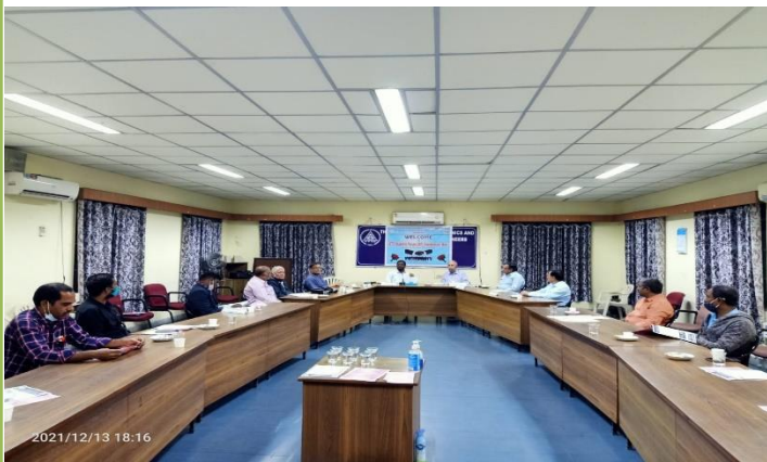
Interaction with ISF Faculty Coordinators